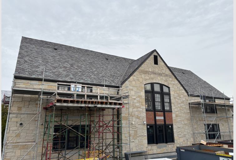
Scaffold installation in progress on the east side of the building, getting prepared for the final existing roof tear-off for the project!