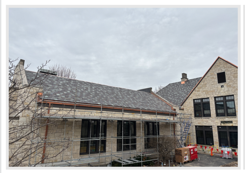
View from the Courtyard at one of the recently completed roofs atop the Gym and Office areas on the southwest side of the building!